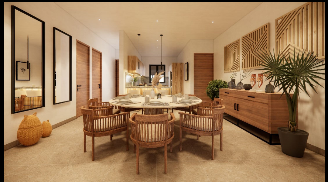
TYPE A CORNER 177,00 m 2 / 1,905 sqf