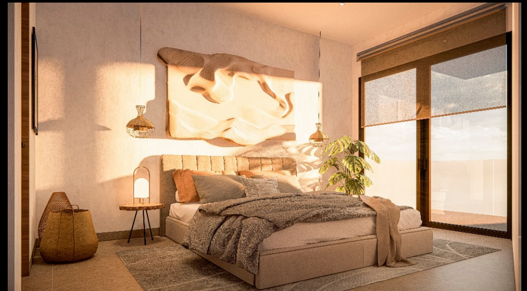
TYPE A CENTER 177,00 m 2 / 1,905 sqf